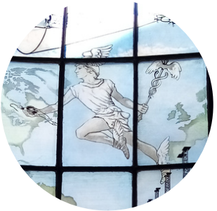
Mercury - Roman God of communication